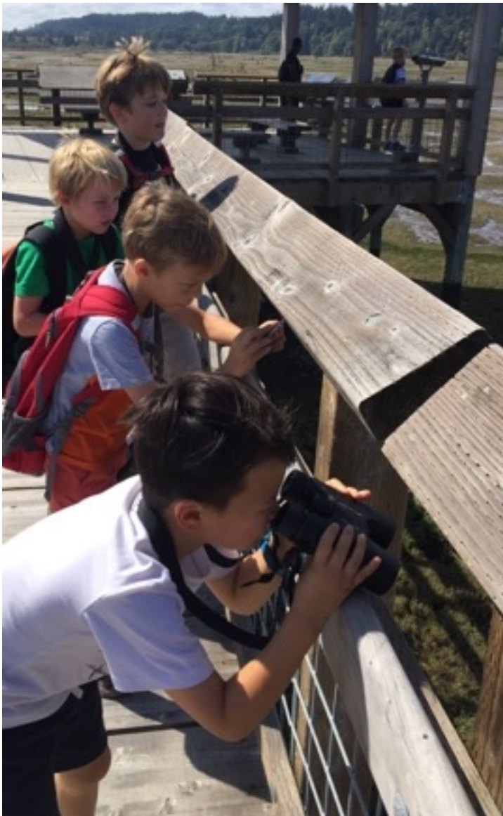
Pack 9 Scouts explore the Nisqually National Wildlife Refuge.

Please join us on Thurs., Sept. 14 at 6:30 p.m. in the St. Joseph School auditorium to join or learn more about scouting. St. Joseph School – 700 18th Ave E, Seattle, 98112